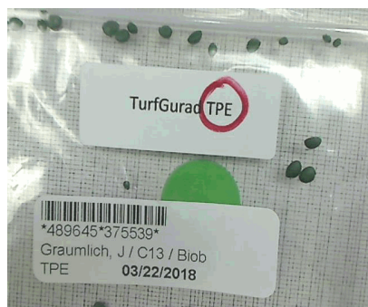
Package received - labeling COC

Laboratory Number Beta-489645 Percent modern carbon (pMC) 49.68 +/- 0.16 pMC Atmospheric adjustment factor (REF) 100.5; = pMC/1.005