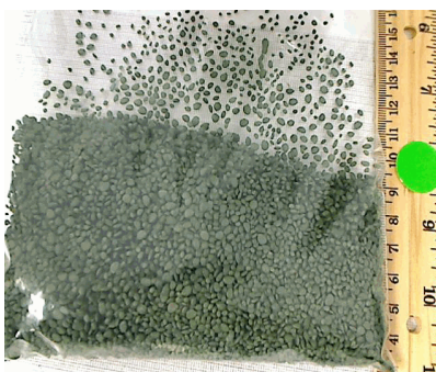
View of content (1mm x 1mm scale)