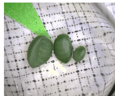
21.0mg analyzed (1mm x 1mm scale)

Disclosures: All work was done at Beta Analytic in its own chemistry lab and AMSs. No subcontractors were used. Beta's chemistry laboratory and AMS do not react or measure artificial C 14 used in biomedical and environmental AMS studies. Beta is a C14 tracer-free facility. Validating quality assurance is verified with a Quality Assurance report posted separately to the web library containing the PDF downloadable copy of this report.