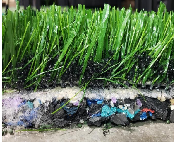
3D3 2" 52 oz with 6 lbs. Sand & 1 lb. Guardian TPE over Brock YSR