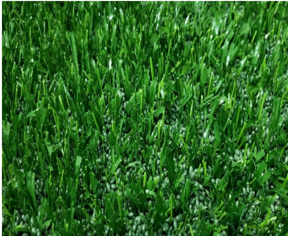
3D3 2" 52 oz with 6 lbs. Sand & 1 lb. Guardian TPE over ProPlay 20